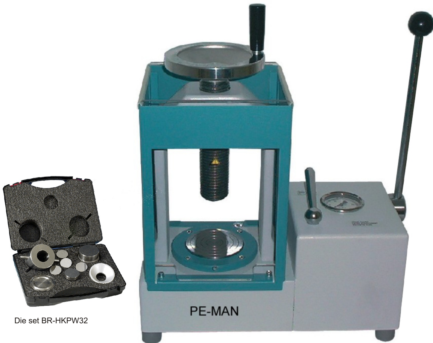
Die set BR-HKPW32

manual hydraulic press for sample preparation